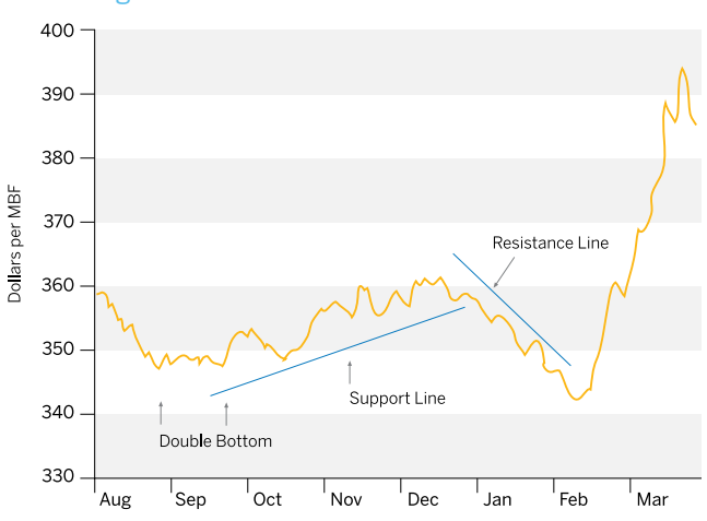
R/L Lumber Futures Prices Daily High-Low Close Bar Chart

TECHNICAL ANALYSIS CAN MAKE A COMPANY'S HEDGE PLANS MORE FLEXIBLE AND MAY RESULT IN MORE PROFIT PER TRADE.